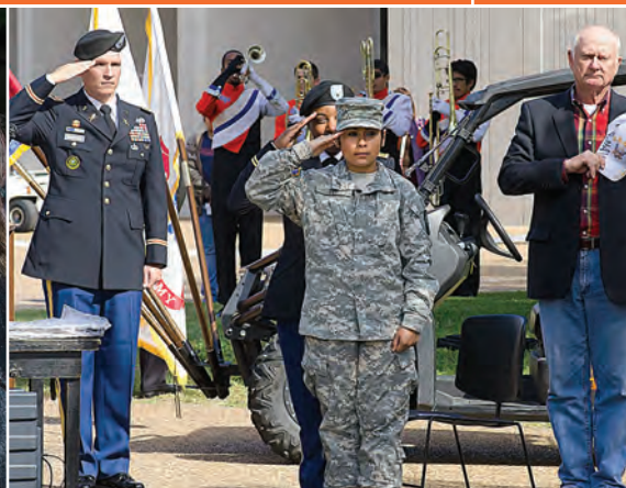
Veterans of all ages came together for a community observance of Veterans Day outside Johnson Coliseum.