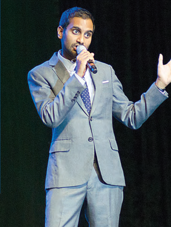
Comedian Aziz Ansari got the fall semester started as the Kat Comedy Showcase headliner in Johnson Coliseum in August.