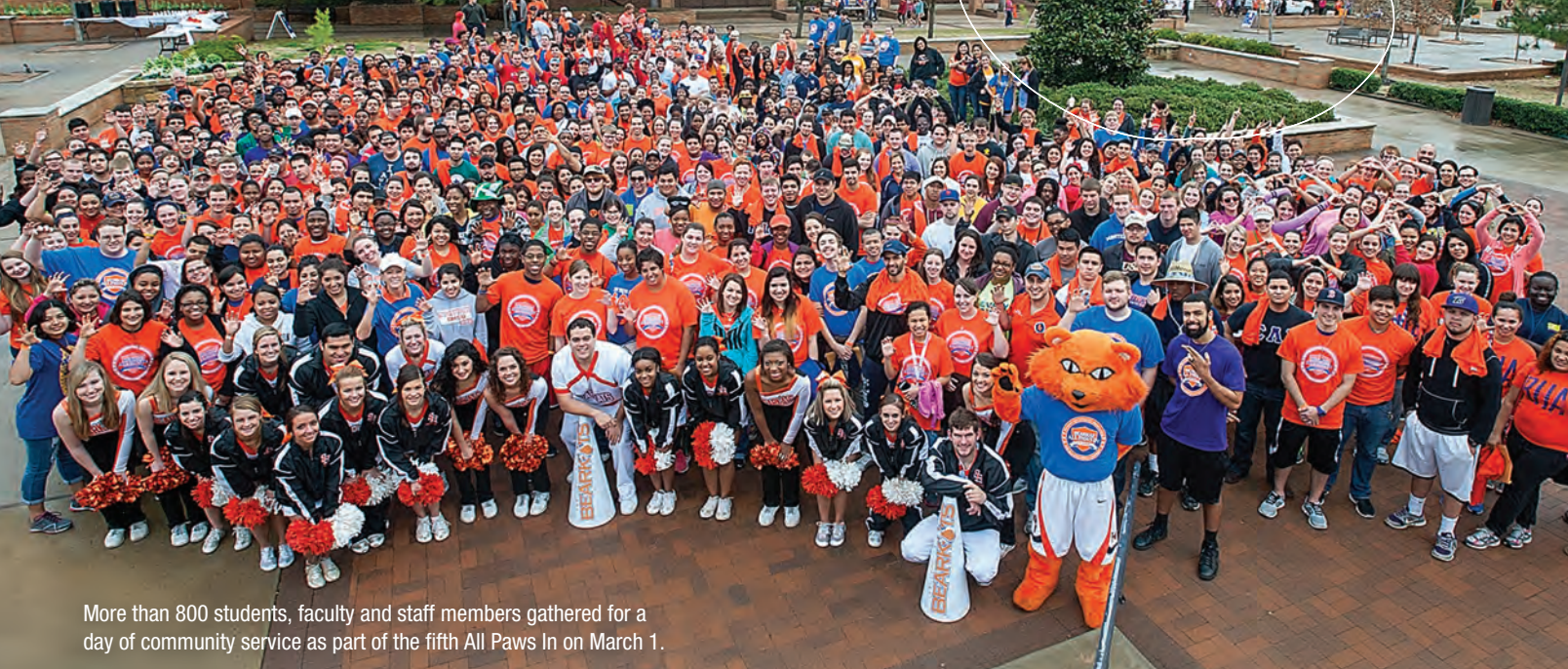
More than 800 students, faculty and staff members gathered for a day of community service as part of the fifth All Paws In on March 1.