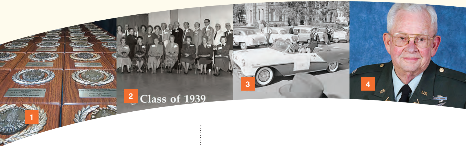
2 Class of 1939

After the merger, the Alumni Association thrived and grew in membership. With new resources available, the association was able to add new activities, events and programs.