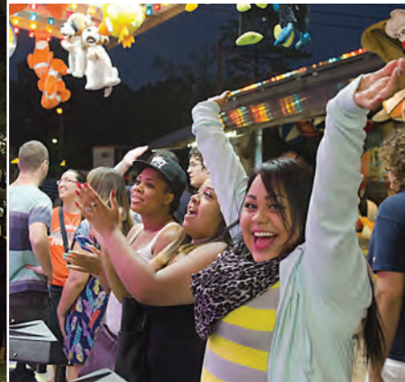
The SamJam Carnival at Holleman Field provides students with fun, games and rides during Homecoming Week.