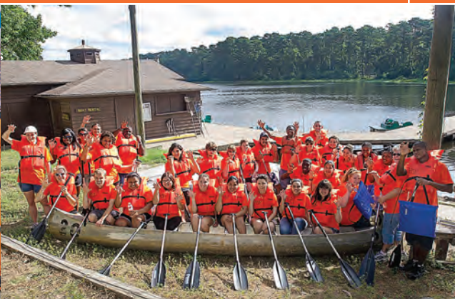
Students returned from summer break to help clean up Lake Raven, at the Huntsville State Park, for the annual Bearkat Service Project, a Welcome Week event.