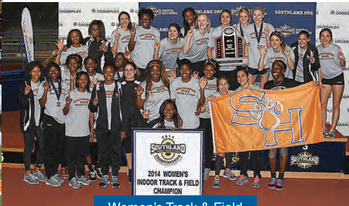
Women's Track & Field