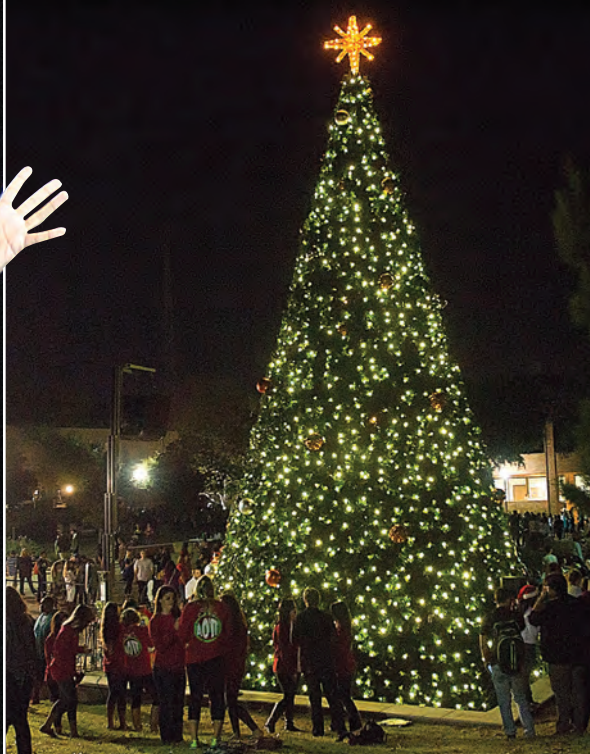
The annual Tree of Light ceremony has been a campus tradition for more than 90 years, kicking off the holiday season for Bearkats.