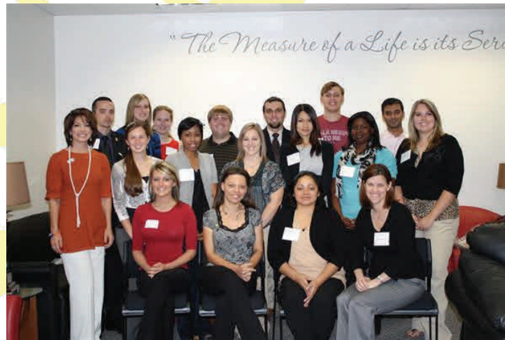
PTK Students enjoyed a reception in the Honors Lounge.

The Honors College hosted a reception for students who transferred to the University and were a part of PTK at their previous college. It was a great success. Honors College Ambassadors met with these students and shared experiences about The Honors College and the University. The Honors College is comprised of new students, current students, and transfers. We would like to encourage every student who is interested in continuing college with academic excellence to consider applying to the Honors College. We also hope to continue the partnership with Phi Theta Kappa!