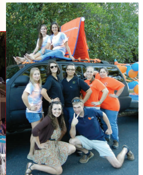
Today @ Sam