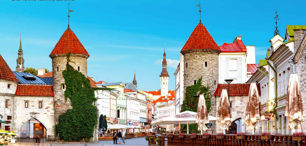
Old Town, Tallinn, Estonia

In his oft-quoted poem, "The Road Not Taken," Robert Frost awakened the idea and determination in many to choose the road less traveled; to overcome fear and avoid regrets. It sparked the quest for adventure in those wishing to experience more from life. Intrepid world travelers manifest this idea by seeking out destinations less traveled, such as Scandinavia and the Baltic Sea, which is surrounded by nine countries in Northern Europe. Here, travelers have the rare opportunity to visit a number of countries and experience a kaleidoscope of cultures in a short period of time when cruising by ship from port to port. Ancient architecture, centuries-old history, storied landmarks, fascinating cities, and breathtaking, romantic scenery provide the perfect backdrop and opportunity to take the road less traveled, which will surely make all the difference.