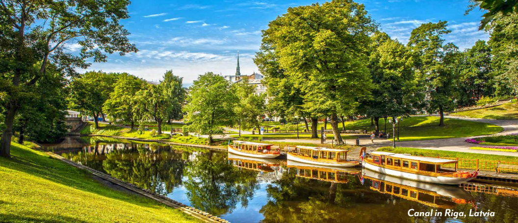
Canal in Riga, Latvia