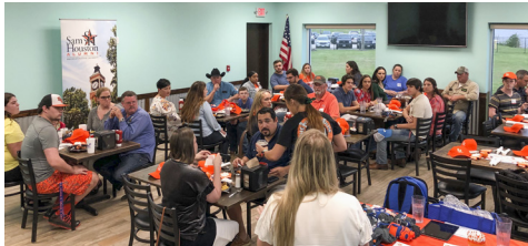
The Office of Alumni Relations partnered with the Office of Accepted Students & Bearkat Orientation to welcome students to SHSU during receptions held in Austin, Beaumont, Dallas/Fort Worth, and The Woodlands. These opportunities are great for the students to learn more about the university and start networking with alumni from their area.