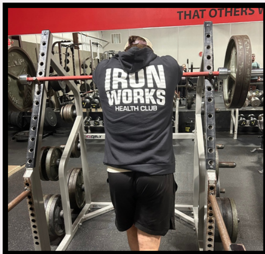
Iron Works Gym and the Sam Houston ROTC Program partnered to allow Cadets to utilize their facilities over the Break.

Diving into the specifics, each of the 21 contributing cadets averaged about 80.32 miles and dedicated 45.79 hours to gym sessions over the winter break. These statistics highlight the individual commitment of each cadet to their physical training regimen. It is noteworthy that maintaining such a high level of dedication during a break is commendable and speaks volumes about the discipline instilled within the cadet community at Sam Houston State University.