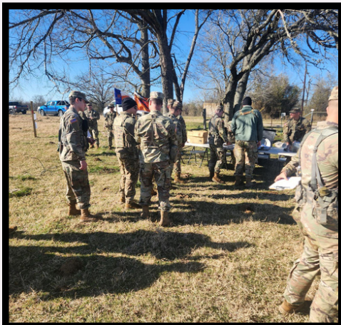
MS2s and MS3s Receiving there Coordinates for Land Navigation