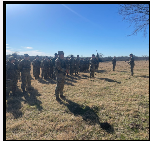
The Battalion's first Lab took place on January 18th