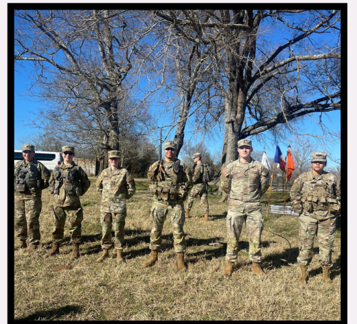
Cadets with Bronze Level Status for either Running and Strength