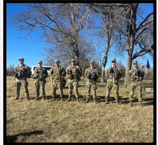
Cadets with Silver and Gold Level Status for either Running and Strength

In recognition of their achievements, each of the 21 participants will be awarded a scholarship from the ROTC program, emphasizing the program's commitment to excellence. Furthermore, five participants will receive both the mileage scholarship and the strength scholarship, underscoring their exceptional performance in both categories. This accomplishment not only celebrates individual achievements but also reinforces the collective strength and dedication within the Bearkat ROTC community. Well done to all participants on this remarkable achievement!