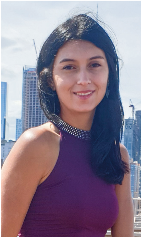
Introducing Bearkat Lucine!!