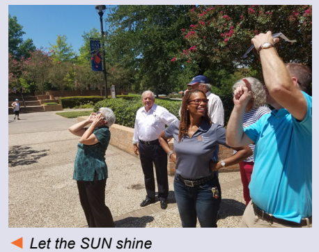
◀ Let the SUN shine