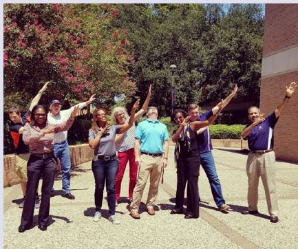
▲ The Eclipse Dab