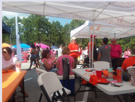
▲ COBA Faculty Tailgating