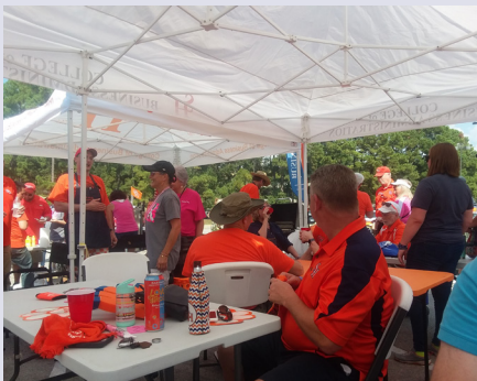
▲ COBA Tailgating