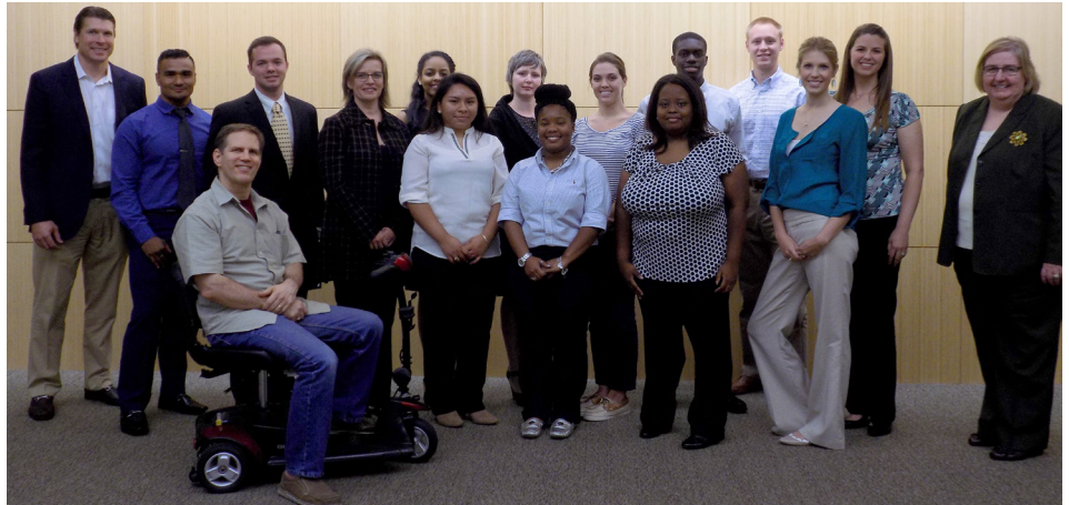
Fall 2015 PMIH Representatives, Scholarship Recipients and Faculty Representative

► The Center for Innovation & Technology (CIT) works with the Center for the Intrepid in San Antonio to provide devices